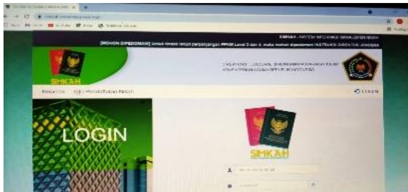
Figure 1 SIMKAH Initial Display

"The procedure for registering for marriage through SIMKAH, begins with logging in on the SIMKAH application page. The SIMKAH application display will appear in Figure 1.