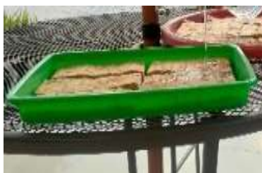
Figure 2. Sowing kale seeds

The research documentation is presented in the image below.