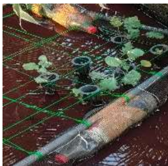
Figure 4. kale growth