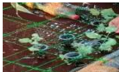
Figure 3. Growth of kale plants