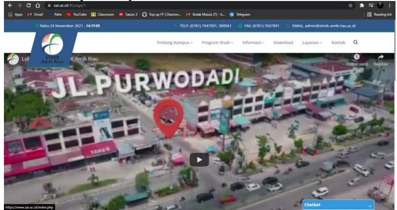
Figure 1. STMIK Amik Riau Information System (sar.ac.id)

Observations directly conducted on the object of research, it is STMIK Amik Riau Information System. It can be accessed at sar.ac.id link. In this information system, observations focus on interfaces related to usability of the system.