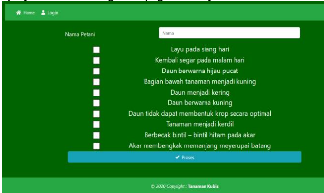
Figure 4. User Diagnosis Page.

The following is a display of the user diagnosis page, namely: