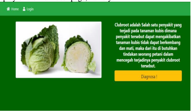
Figure 3. User Main Page.

The following is a display of the main user page, namely: