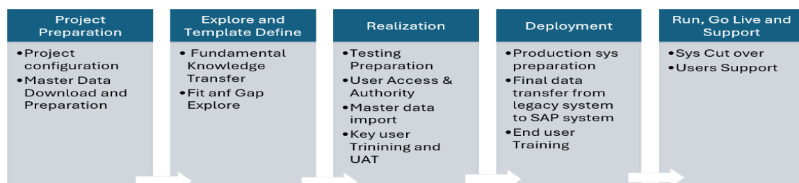
Figure 1. Methodology upgrading sap s/4hana private edition [17],[18].

The methodical, theoretical examination of the techniques used in a field of study is known as methodology. It encompasses the theoretical analysis of a group of concepts and practices related to a topic of study. Stages, theoretical models, paradigms, and quantitative or qualitative methodologies are typically included. [15]. A methodical approach to resolving the research challenge is research technique. It can be thought of as a science that examines how scientific research is conducted [16]. The case study was carried out at two polymer companies in cikarang, namely a polymer-based company that produces PVC and a polymer-based company that produces pipes and household appliances. The research method is based on complete participant observation, in which the researcher fully engages in the day-to-day operations of the object under observation. Figure 1 shows the steps taken to finish this project as follows: