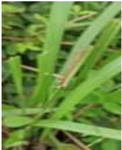
Figure 9. Imperata cylindrica Source (left) Jayalakshmi et al 2010 Right Research documentation

yellow, unclear taste and smell (Jayalakshmi et al. 2010).