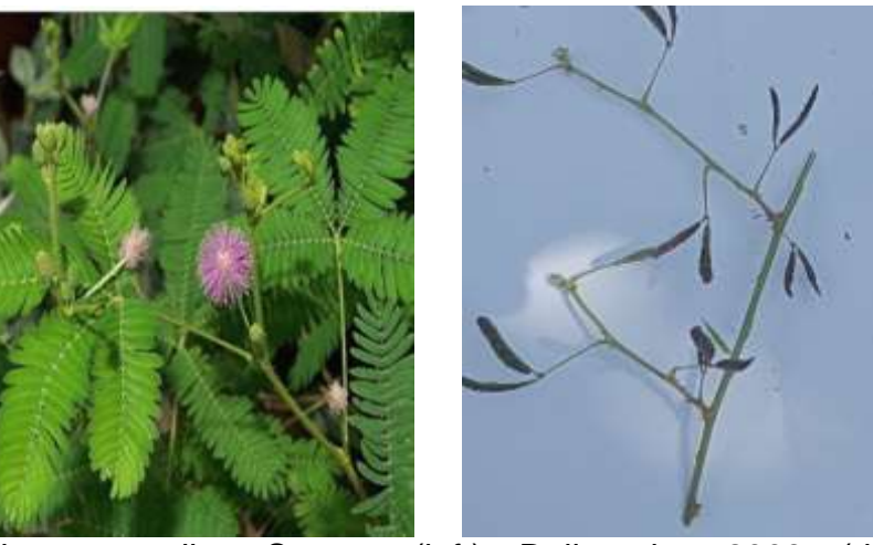
Figure 4. Mimosa pudica Source (left) Dalimartha 2008 (right) Research Documentation

According to Dalimartha 2008, the diameter of mimosa roots ranges from 1-5 mm and has a distinctive odour that resembles the smell of jengkol. Young stems of mimosa pudica are strikingly green and old stems are red. Flowers are pink with a round shape, stout spines, small petals and have pink corolla leaves. Flowers on this plant are composed of 4 lobes with a total of 4 seeds and have a large number of ovules (Ahmad, 2011). The flowers of the putri malu plant