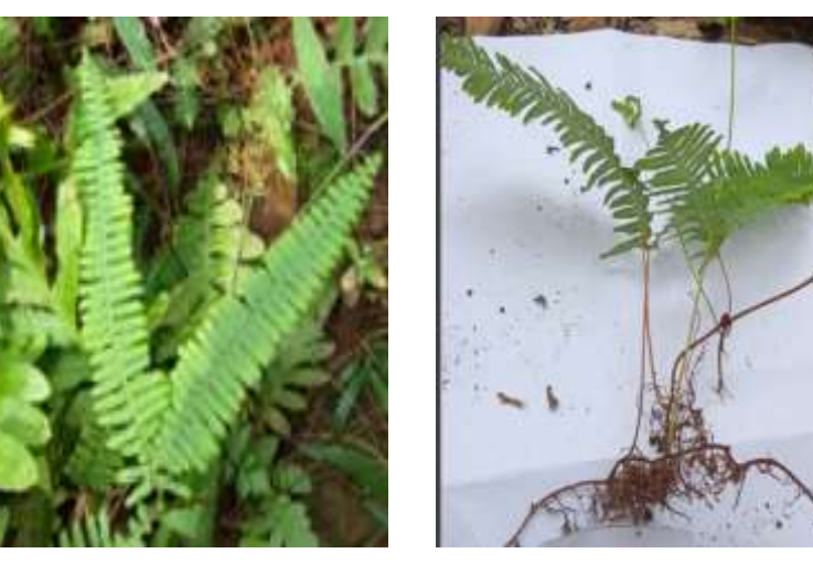
Figure 14. Dicranopteris linearis source (left) yolla et al 2022 (Right) Personal Documentation

pinnate, the shape of the leaves is elongated, with flat leaf edges, smooth surfaces, pointed leaf tips and flat leaf