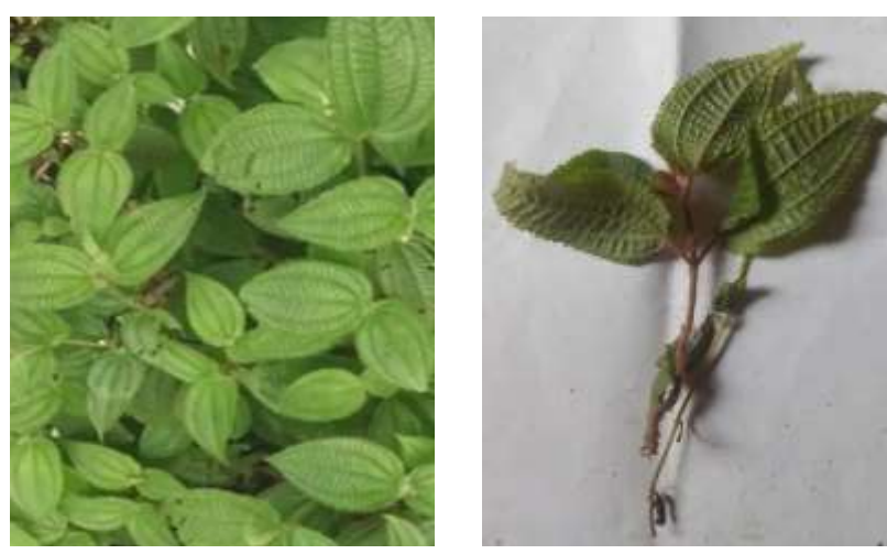
Figure 5. Clidemia hirta Source (left) Sandoval and Rodriguez 2014 (right) Research documentation

Clidemia hirta is a branched shrub with woody stems that are erect with a few brown scales having single ovalshaped leaves covered with hairs or flat leaf edge hairs. Clidemia hirta L flowers are located at the ends of white stems and include compound flowers.