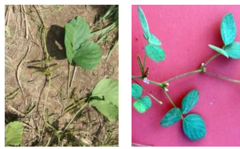
Figure 17. Calopogonium mucunoides

Calopogonium mucunoides is a plant with fibrous roots that branch out and has a round stem that twists at the part of the stem that produces roots.