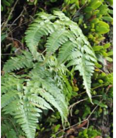
Figure 18. Davallia denticulata Source (Left) Research Documentation (Right) https://uforest.org/plants/species?q=Davallia_denticulata

The leaf surface is smooth, the largest leaf width is about 3 cm and the largest leaf length is about 4.3 cm. Sori are round to elongated which can be found on the lower surface of the leaf