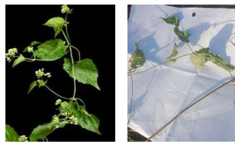
Figure 19. Mikania micrantha

Mikania micrantha is a climbing shrub. Its heart-shaped leaves are arranged opposite each other.