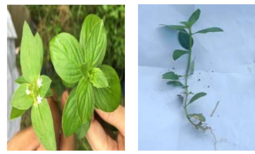
Figure 7. Borreria latifolia L (Potato)

Borreria latifolia is a herbaceous plant with a taproot system.