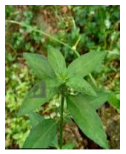
Figure 6. Borreria laevis

and is purple in color. The leaves are opposite, oval in shape, the leaf edges are flat, the leaf base is blunt and the leaf tips are pointed, the leaves are green with purple leaf edges. Has bell-like flowers that grow in the leaf axils.