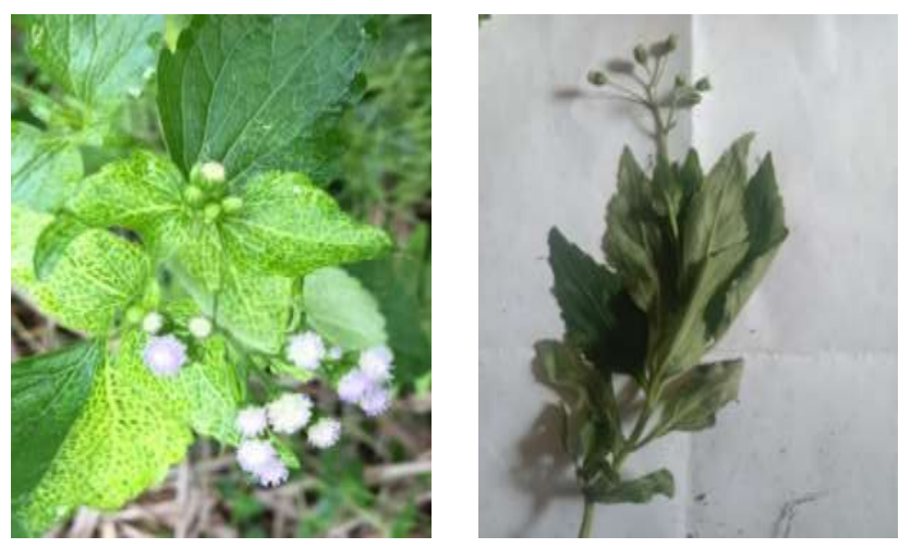
Figure 8. Ageratum conyzoides (Babadotan)

Ageratum conyzoides is a shrub with a taproot system, 26-29.4 cm tall. The stem is round with fine hairs, purplish green in colour. Single leaf position opposite, ovoid leaf shape, tapered leaf tip with serrated leaf edges and pinnate leaf reinforcement, leaf surface downy, green leaves. Babadotan flowers are in the leaf axils fused into a bouquet with a bell-shaped crown with white or purple colour.