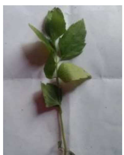
Figure 3. Chromolaena odorata (Kirinyuh) Source (left) https://ccrc.farmasi.ugm.ac.id (right) Research Documentation