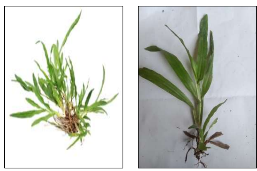
Figure 10. Paspalum conjugatum Source (left) yolla et al 2022 (right) Personal Documentation

of the stem, have two panicles, composed of lanceolate-shaped grains, which are attached along the panicle, fine hairs, greenish white in color. Taproot, with many branches and root hairs, brownish in color.