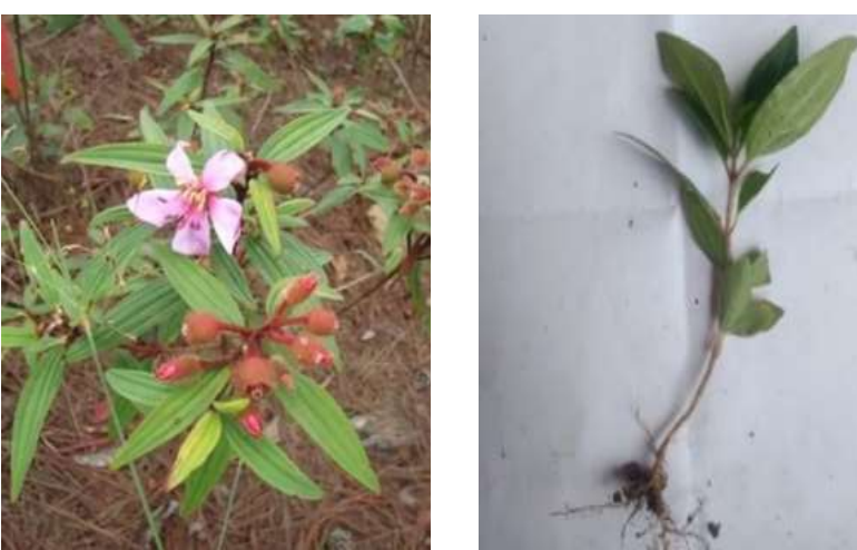
Figure 2. Melastoma malabathricum

have three clear leaf bones and extend straight above the leaf tip. The brown coloured fruit is round like a flower vase, the ripe fruit will break into cracks and be divided into several parts. According to tjitrosoepomo (2013) the fruit of M. malabathricum tastes sweet and can be eaten.