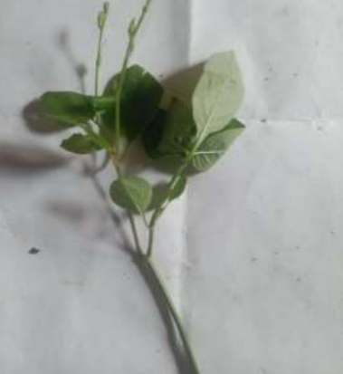
Figure 11. Asystasia gangetica

According to Moenandir, 2006. Asystasia gengetica is a herbaceous plant that grows quickly and is easy to reproduce. It has a soft stem, brownish green in color, the stem is soft so that the stem is easily broken if touched. The leaves are opposite, oval in shape, rounded at the base, pointed at the tip. The taproot system, has small branches, has root hairs and is brownish white in color. The flowers are white with purple mosaics on the petals and the flowers are