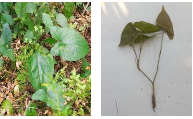
Figure 16. Typhonium blumei source (left) Heng and Hetterscheid 2010 (Right) Personal Documentation

Typhonium blumei is a herbaceous plant similar to taro that has oval leaves with pointed heart-shaped tips. One plant