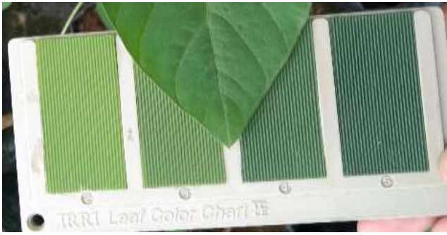
Figure 1. Leaf Color Scale Measurement Using Leaf Color Chart

the color of a leaf is directly proportional to the increased concentration of chlorophyll within the leaves.