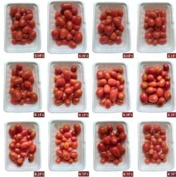
Figure 2. Cherry Tomato Plant Harvest Results

fruit weight. Table 5 shows detailed data on the average fruit weight per cherry tomato plant resulting from combining LOF concentration and frequency treatments.