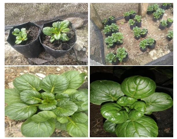
Figure 4. Research documentations

The results of the measurement of the dry root weight of pagoda mustard showed significant variations between treatments. The highest value was obtained in treating 200 ml Jakaba and 5 00 g biochar with a dry root weight of 8.2 grams, indicating that combining coconut shell biochar and Jakaba at a certain dose can increase plant root development. Conversely, the lowest value was found in the control treatment, which was 1.14 grams, indicating that root growth was less than optimal without additional treatment. This difference in weight indicates that the administration of coconut shell biochar and Jakaba can potentially increase the plant root system, which plays a role in the absorption of nutrients and water more efficiently. A similar study by (Suharyatun et al., 2021) found that combining rice husk biochar and microbialbased organic fertilizer increased vegetable growth and production, including root growth parameters. A different study (Nurbaiti, 2023) showed that the provision of liquid organic fertilizer has not significantly increased soybean plants' growth and yield. However, providing rice husk biochar gave the best results in several growth parameters.