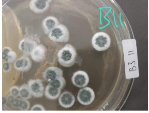
Figure 2. Fungal colony of isolate B11

Description: isolate code = jakaba sample analyzed