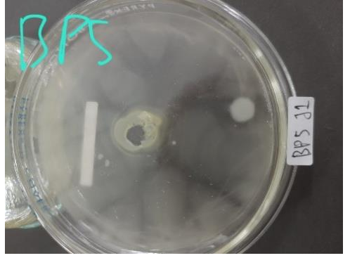
Figure 3. Bacterial colony of isolate BP5

This study revealed that Jakaba does not contain a single type of microbe or fungus but is a consortium of fungi and bacteria that work together to improve soil fertility and increase the growth of chili plants. Research on Jakaba fertilizer as a biological fertilizer contains 6 isolates of bacteria and 4 isolates of fungi suspected of forming a consortium in influencing plant growth and soil fertility. Jakaba biomass, such as roots, can be fungal biomass while other solutions contain bacteria. The characteristics of the isolates are described in table 1. Following the growth of colonies in petri dishes. Each isolate of bacteria or fungi that grows on Jakaba fertilizer has different potentials that we can explore in further research.