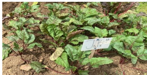
Figure 2. Comparison of Leaf Area in Planting Distance Treatments

Despite differences in harvest age, the leaf area index (ILD) did not increase because leaf area tends to stabilize after reaching the generative phase. Therefore, additional harvest time only increases tuber biomass accumulation, not canopy expansion. Furthermore, photosynthate allocation at later ages is directed more toward tuber enlargement than to new leaf formation, so the ILD remains relatively constant. Environmental factors such as light intensity and nutrient availability play a greater role than harvest age in determining these parameters. According to Nurholis et al. (2023), vegetative parameters such as ILD tend to be unresponsive to harvest age treatment.