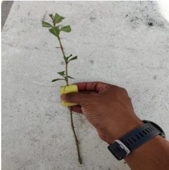
Figure 2. Sponge used as a germination medium

Planting in Hydroponics is done using the deep-water culture (Deep Culture) or raft-floating method. The easiest hydroponics system implemented and managed at an economical cost. Size of the container on the system hydroponics: 1m long × 3m wide × 0.3m high. Suitable plants are planted with the technique. This plant has a short life cycle. This technique is very practical for planting leafy vegetables like mustard greens, water spinach, and kale. It also reduces electricity use, conserves water, and makes it easier to purchase materials and equipment.