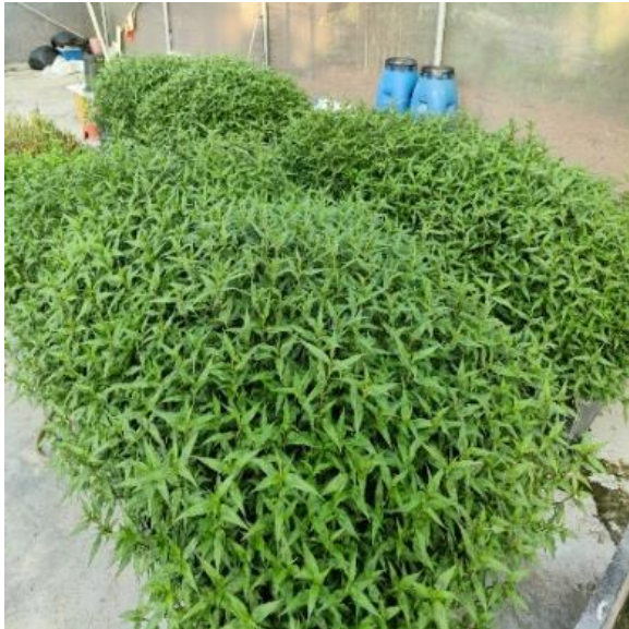
Figure 5. Effect of Potassium on the Growth of Plant Kesum

Based on Table 3, potassium administration to the hydroponic system disrupted root growth, with optimal responses at 150 mg L -1 K for biomass and 100 mg L -1 K for long roots. The weight of wet root increased significantly from 9.26 g (0 mg L -1 ) to a peak of 31.15 g at 150 mg L -1 , then decreased at 200 mg L -1 (22.78 g), indicating the existence of stress osmotic consequences of excess K ions. The weight of dry root reaches a maximum of 16.05 g at 50 mg L -1 and decreases with increasing dose, up to 11.44 g (200 mg L -1 ), indicating a decline in the efficiency of material accumulation and a disturbance of metabolism. Root length was highest, recorded 28.52 cm at 100 mg L -1 , decreasing sharply at 150–200 mg L -1 (22.31–14.65 cm), possibly because of inhibition of growth end roots by K toxicity. Overall, a K concentration of 100–150 mg L -1 provides the best balance between root development and elongation roots, while deficiency (0 mg L -1 ) and excess (>150 mg L -1 ) inhibit root system development in a significant way. According to Mazlina et al. (2024), potassium plays a role in improving plant metabolism, leading to the formation of proteins, carbohydrates, and starch that make up the heavy wet.