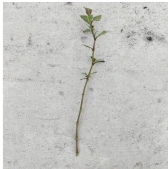
Figure 1. Planting materials used

Kesum plants can be grown hydroponically. Kesum plants approximately 15 cm long, with 7–9 nodes, are selected as planting material. The leaves and side shoots on the cuttings are removed, leaving only the leaves on the main shoot to support growth. The kesum plants are then clamped with a damp sponge so they can hang, then inserted into the planting hole in the Styrofoam. In the hydroponic system, the kesum plant will be submerged to a depth of 7.5 cm in the nutrient solution, with the top 7.5 cm above the surface of the Styrofoam. Hydroponic planting of kesum plants is best done in the afternoon to minimize stress on the planting material. Roots on kesum cuttings usually begin to form after three days.