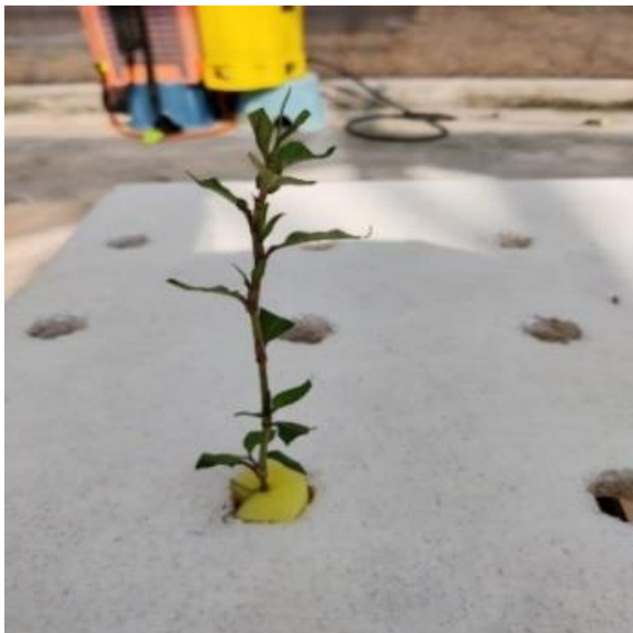
Figure 3. Planting plants in a hydroponic container