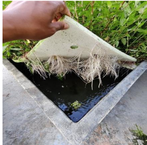
Figure 6. Effect of Potassium on Plant Rooting

Besides that, according to Fernandus (2022). stated that an unstable temperature can lower results because it affects physiological and biochemical processes in plants, such as photosynthesis, respiration, and turgidity. Weight wet high roots often reflects consistent absorption of water and nutrients, with improvement significant at 150 mg/L.