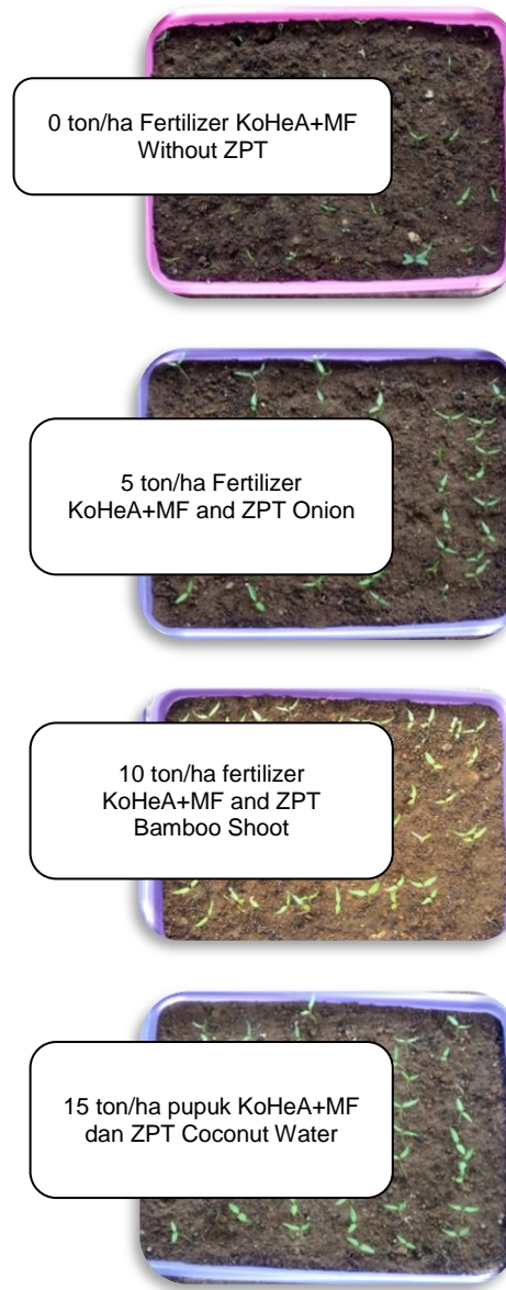
Figure 2. Appearance of the germination power of red chili seeds of the Lotanbar variety