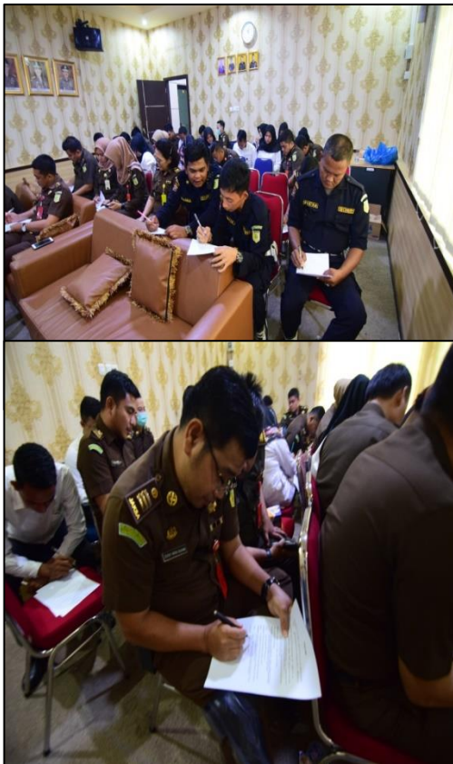
Picture 2. Classroom Learning

effective than self regulated learning (SRL) using ecuator application. Respondents reasons who were agree for the effectiveness of classroom learning than SRL using ecuator application are as follows: 1)easier for understand the lesson, 2)active during the class, 3)guided directly by tutor, 4)more interaction in class 4)active to ask, 5)more clearly explanation, 6)more focus or concentration, 7)more communication, 8)more enjoy, 9)more efficient and scheduled the time, etc.